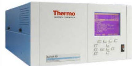
i-Series (2005 – Present) select models only