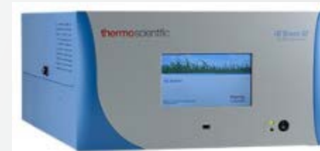
iQ Series (2017 – Present)