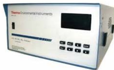
"C" Series (1992 – 2007)