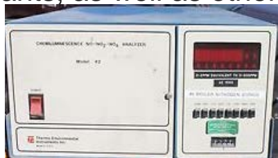
Pre "C" Series (1970's – 1993)