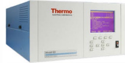
i-Series (2005 – Present) select models only