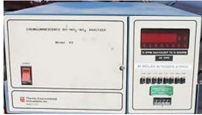
Pre "C" Series (1970's – 1993)