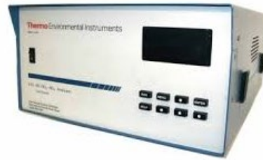
"C" Series (1992 – 2007)