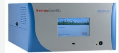
iQ Series (2017 – Present)