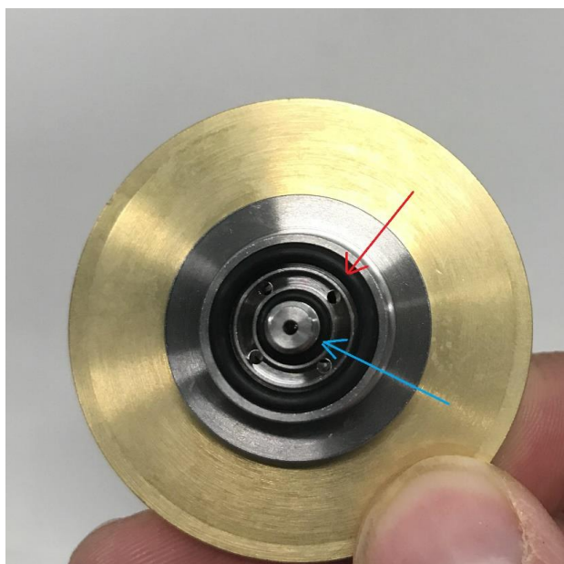
Figure 3 VA-77

O-RING REPLACEMENT, VA 76, VA77, 750x753x