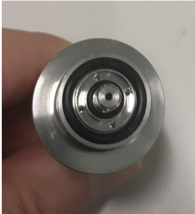
Figure 6 VA-76