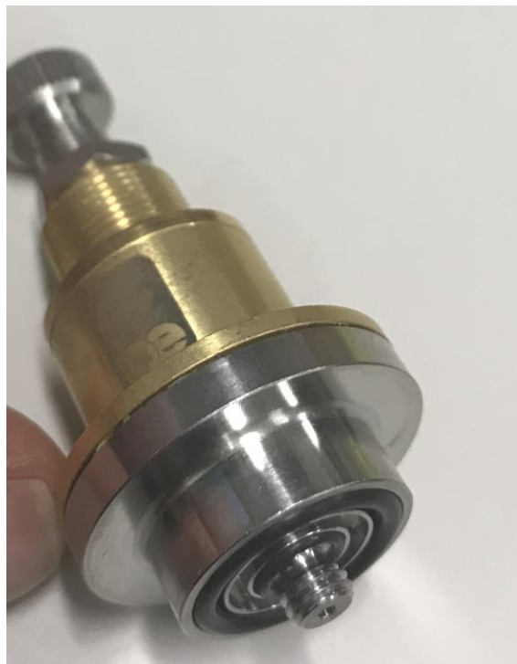
Figure 5 VA-76

O-RING REPLACEMENT, VA 76, VA77, 750x753x