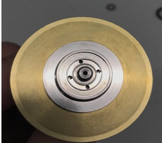
Figure 4 VA-77