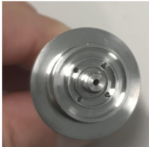
Figure 7 VA-76